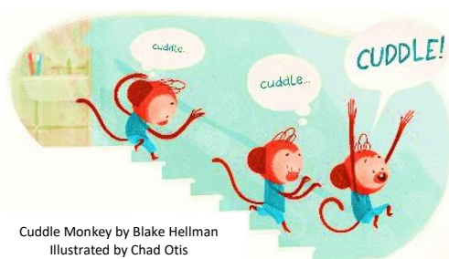
Cuddle Monkey by Blake Hellman Illustrated by Chad Otis

Fellowship group on a Wednesday evening and elders / leaders meetings have all been able to continue thanks to Zoom too. But what about our individual members? What have we all been getting up to over the year with restrictions?